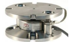
Accupoint weigh module