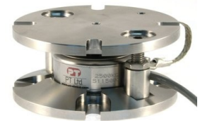
Accupoint weigh module